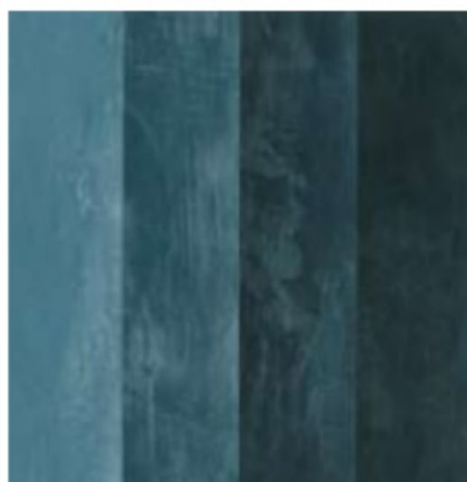
DEEP SEA BLUE

300 250 200 150 SQ. FT. COVERAGE PER 2 COATS